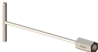
AI-TR-501-SS PULL ROD

Used for top repairable bladder accumulators. The “T” section of the pull rod is designed so that the rod cannot fall into the accumulator and also provides additional leverage for the technician to properly remove the bladder.