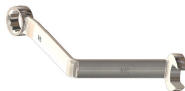
AI-515-KIT TR GAS VALVE TOOL

This is a set of 2 specially-designed wrenches for the installation or removal of the gas valve in a 6000 psi top-repairable accumulator.