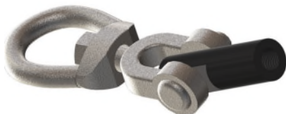
AI-511 LIFTING HOOK ASSEMBLY

Our lifting hook assembly allows the user to connect a chain or other lifting apparatus to the gas end of our accumulators. We recommend this tool to lift all accumulator sizes over 2.5 gallons. Load-tested assemblies available with a test certificate at additional cost. Standard size is 7/8”-14; 2”-12 size available as part number AI-GT-511.