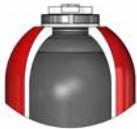
TOP REPAIRABLE (TR) OPTION

Carbon steel standard. Also available in stainless steel, carbon fiber, and with a wide variety of protective coatings. Contact us for more information.