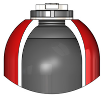
TOP REPAIRABLE (TR) OPTION

Carbon steel standard. Also available in stainless steel, carbon fiber, and with a wide variety of protective coatings. Contact us for more information.